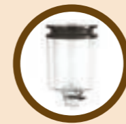
Blow-up Hopper (non-Mignon)